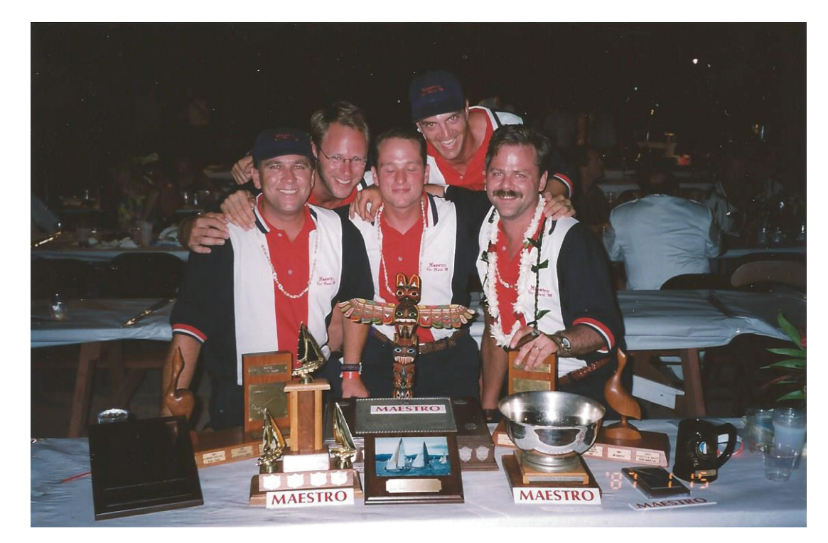
Maestro cleaned up. Good work, crew.

Icing on the cake - one more pleasure from the trip