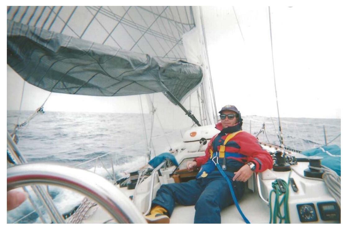
Still cold. Still white sails.