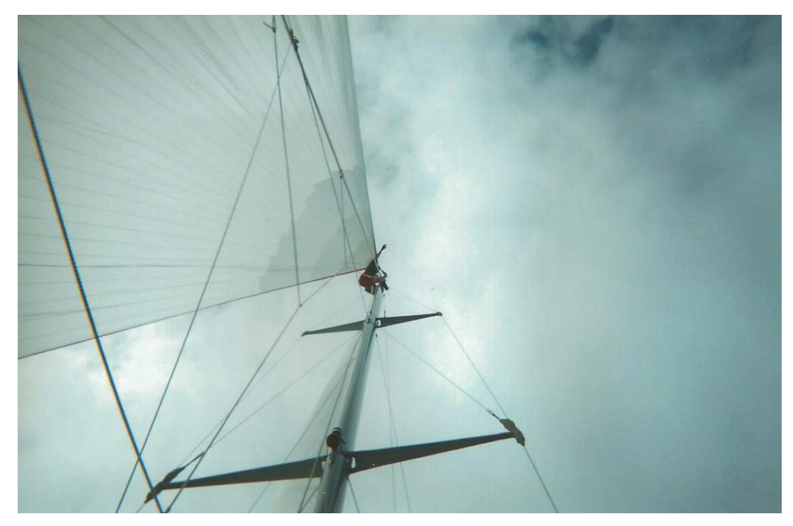
At times like this the driver is being very, very careful.