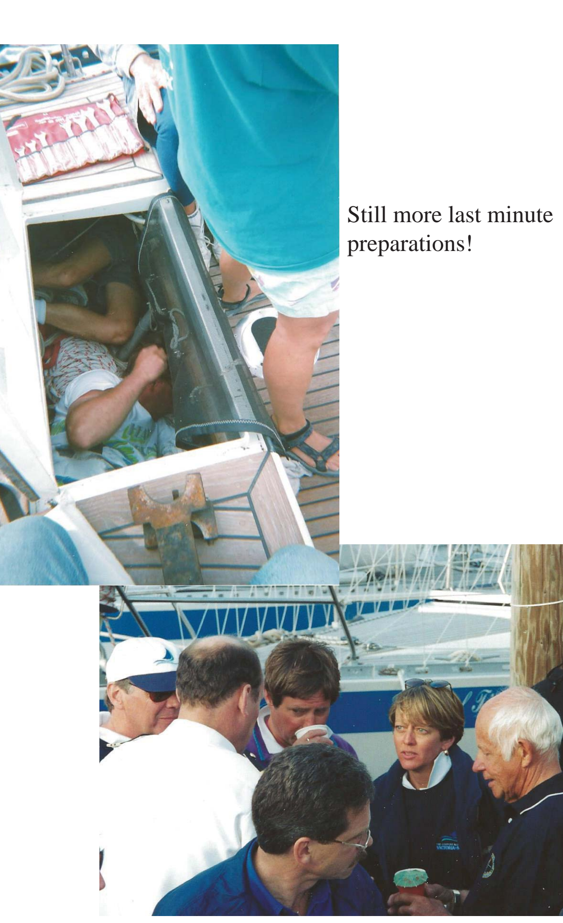
Mai tais at a dock party in Victoria