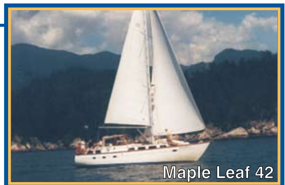
Maple Leaf 42

If you know how to boat or would like to hire a skipper, charter one of Blue Pacific's well-maintained yachts and explore Desolation Sound, the Gulf Islands, the San Juans or the Sunshine Coast. We are conveniently located on Granville Island and offer bareboat and skippered charters on sail and power boats from 27 feet to 65 feet. To see our fleet, go to www.bluepacificcharters.com then call or email us to check availability.