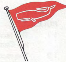
LAHAINA YACHT CLUB