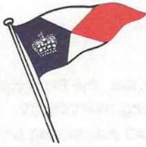
ROYAL VANCOUVER YACHT CLUB