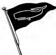
LAHAINA YACHT CLUB