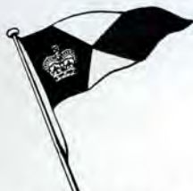
ROYAL VANCOUVER YACHT CLUB

Sponsored By The ROYAL VANCOUVER YACHT CLUB