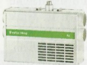
Viking Air 3 Kw 10,250 Btu's