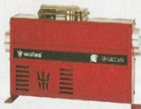
Spartan 4.5 Kw 15,400 Btu's